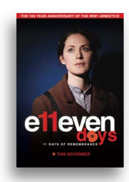
Click here for the posters