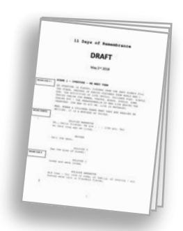
Click here for the script